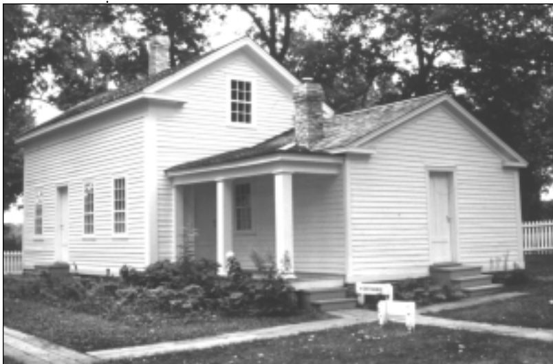
The John H. Stevens House (1849) was built on a simple broadside plan; it is now located in Minnehaha Park in Minneapolis. Note the eave-returns on the gables, the simple pilasters at the corners, and the six-over-six windows, which are characteristic of this style.

Before we consider the early styles, it is important to realize that there are categories of buildings for which no academic designation of a style can be assigned. These buildings, often referred to as "vernacular," include subsistence dwellings as well as in industrial structures. Most of these buildings were modest and constructed of readily available local materials. Log buildings were common in forested areas. Stone buildings could be found along rivers with limestone and sandstone ledges. Sod houses were